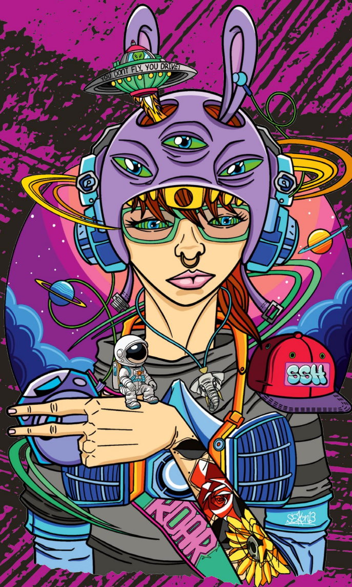
Artist: Ashton Filmer, Street Smart High presenter.